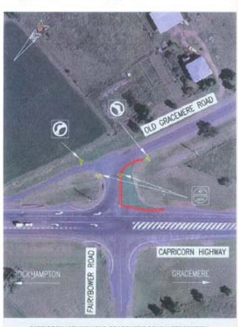
CAPRICORN HIGHWAY/OLD GRACEMERE ROAD INTERSECTION