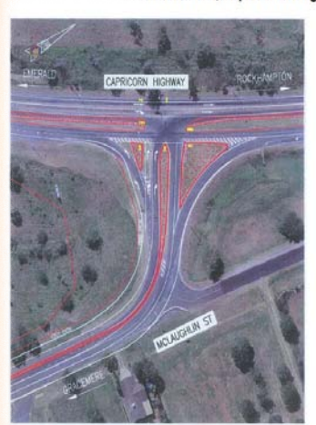
Gracemere (Capricorn Highway) Intersection Upgrade

Community feedback will be considered when determining any changes to the Capricorn Highway and Old Capricorn Highway intersection.